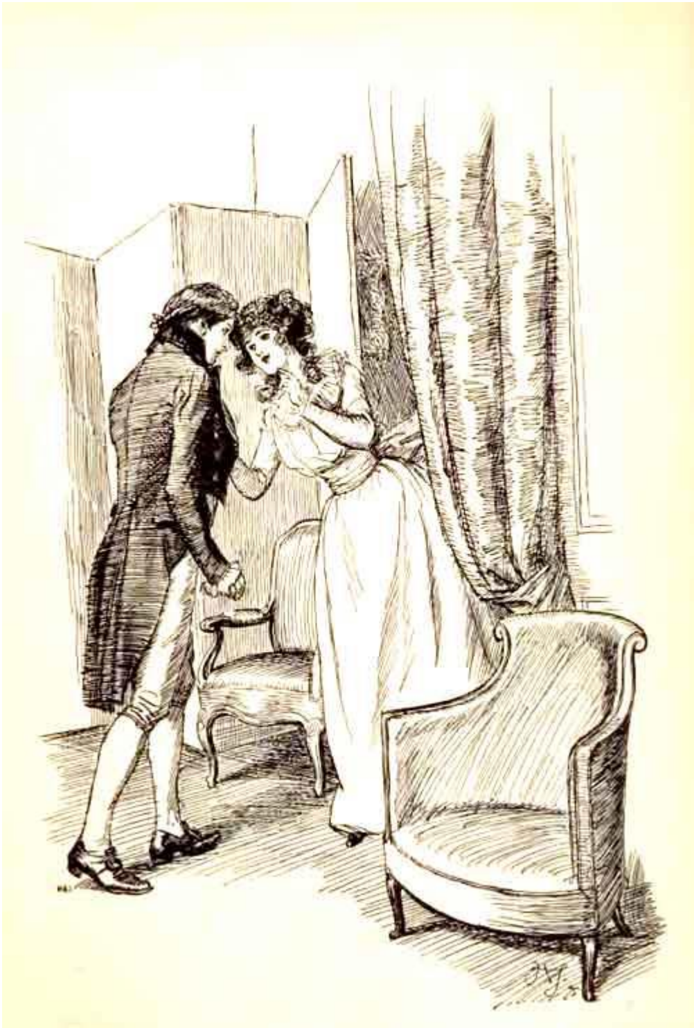
Drawing him a little aside.