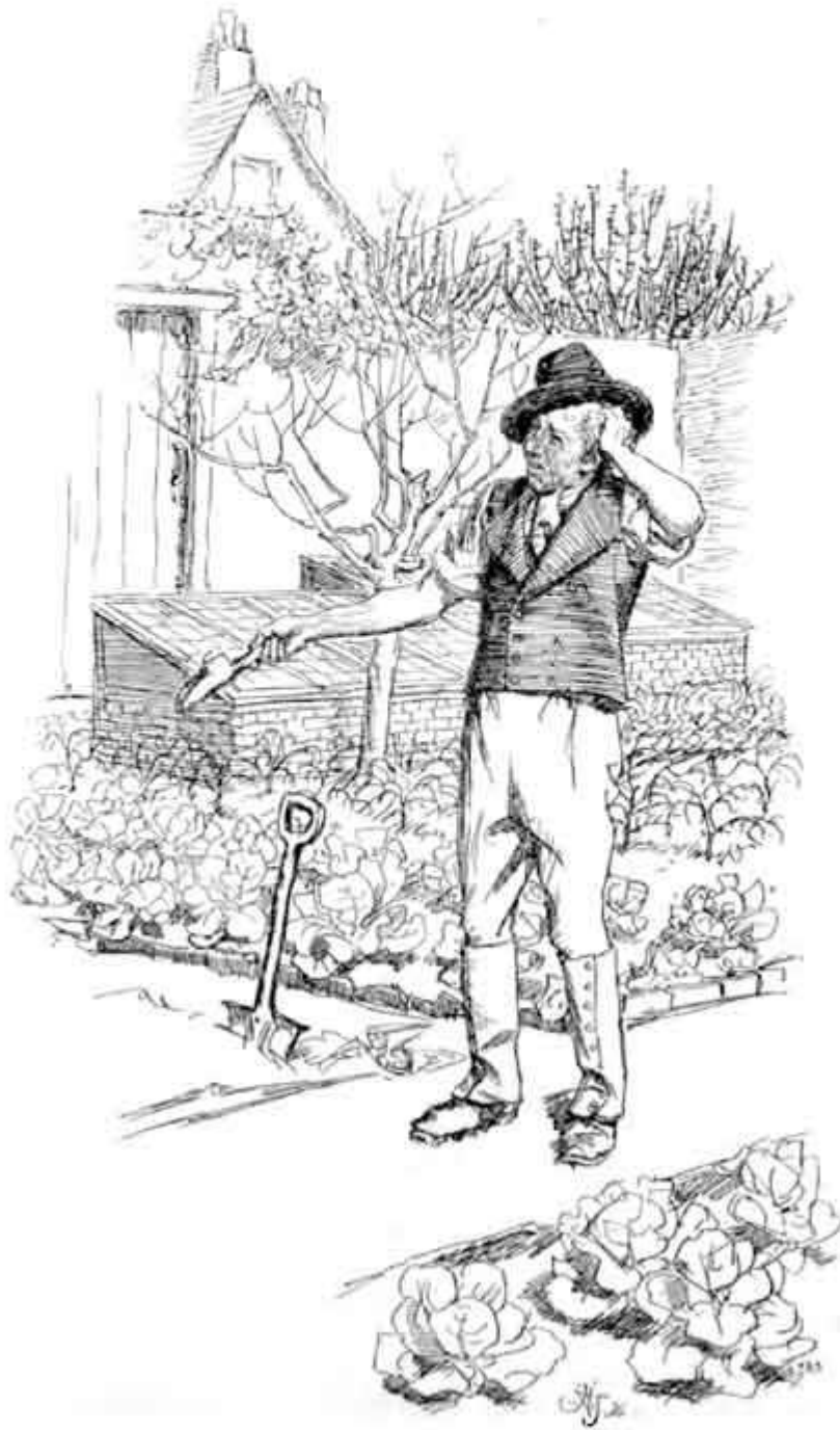
The gardener's lamentations.