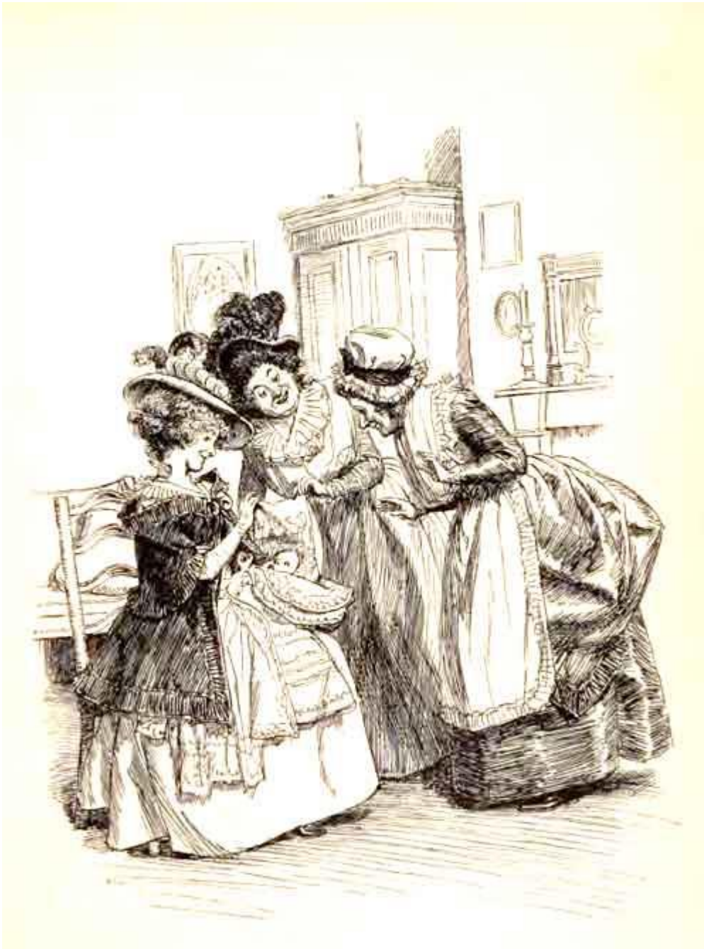
Showing her child to the housekeeper.

She returned just in time to join the others as they quitted the [270]house, on an excursion through its more immediate premises; and the rest of the morning was easily whiled away, in lounging round the kitchen garden, examining the bloom upon its walls, and listening to the gardener's lamentations upon blights, in dawdling through the green-house, where the loss of her favourite plants, unwarily exposed,