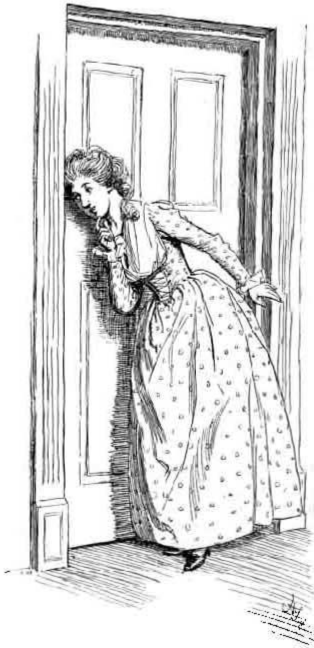
Listening at the door.