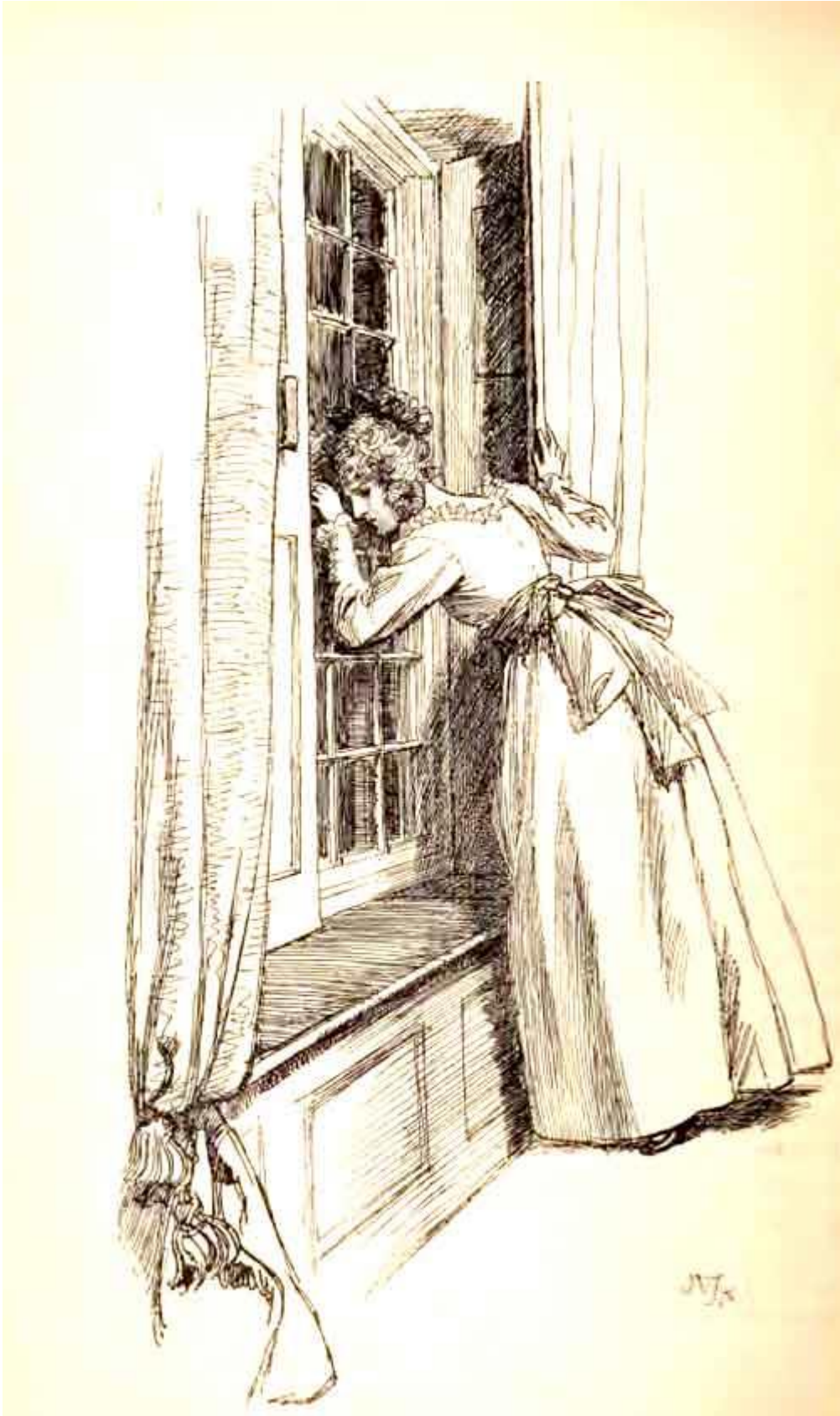
"Opened a window-shutter."