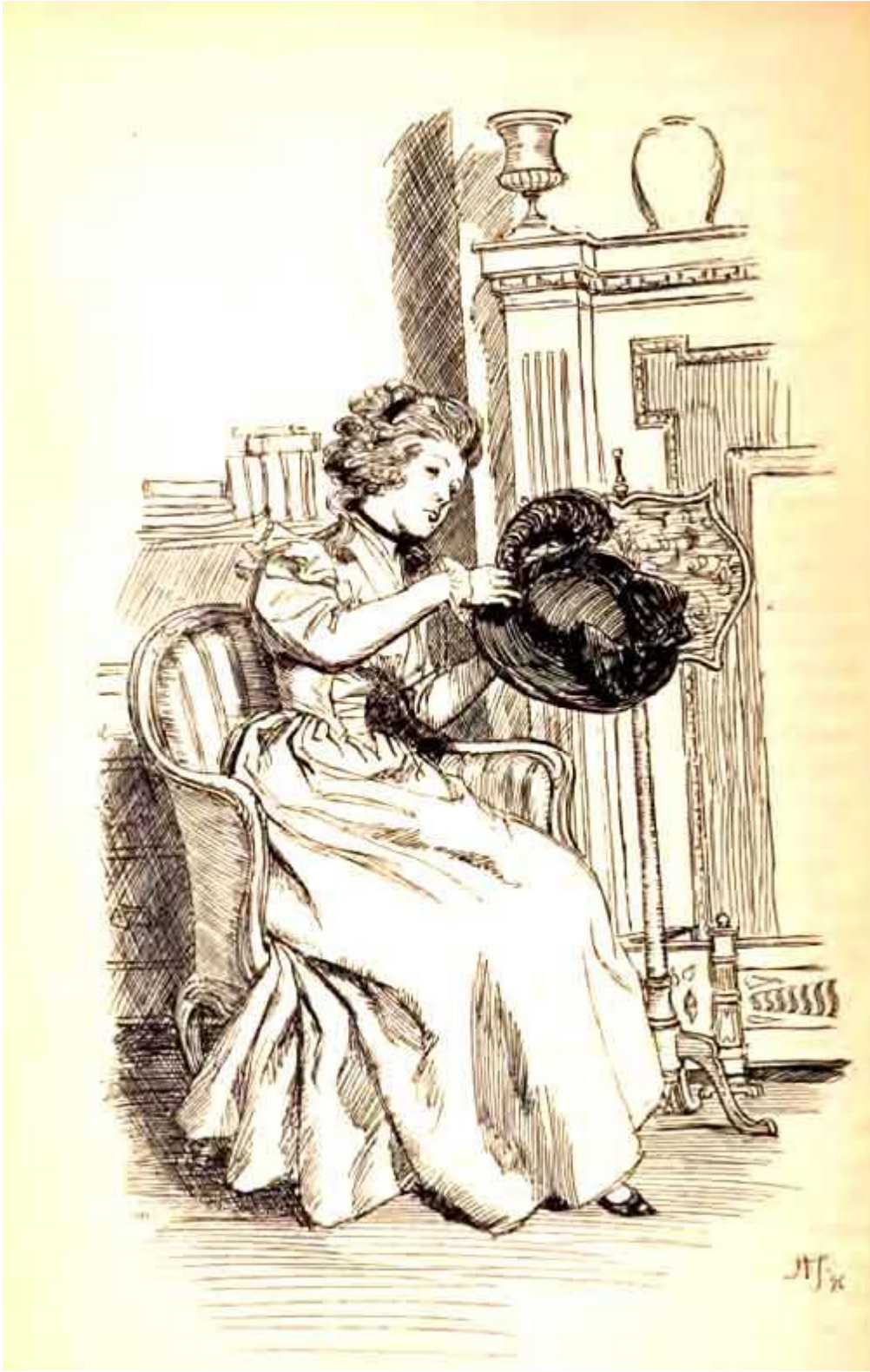
"She put in the feather last night."