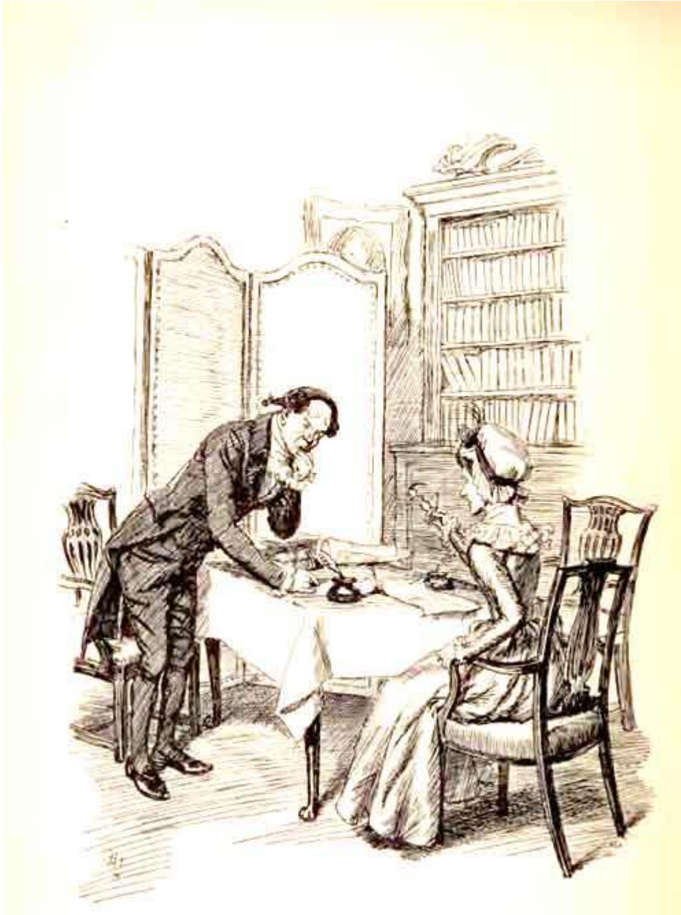
Talking over the business.